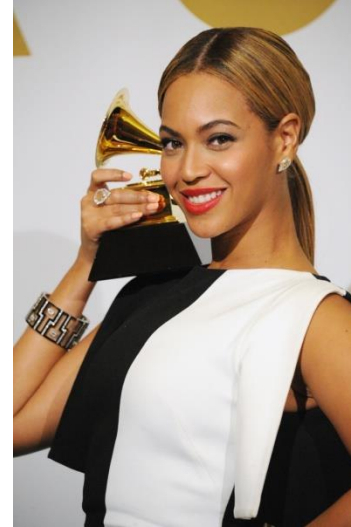
Beyonce 碧昂斯 Bi ang si

Quizlet reference sets: Facial features & adjectives Body parts & adjectives Countries & cities Chinese=China + 人 American=America + 人